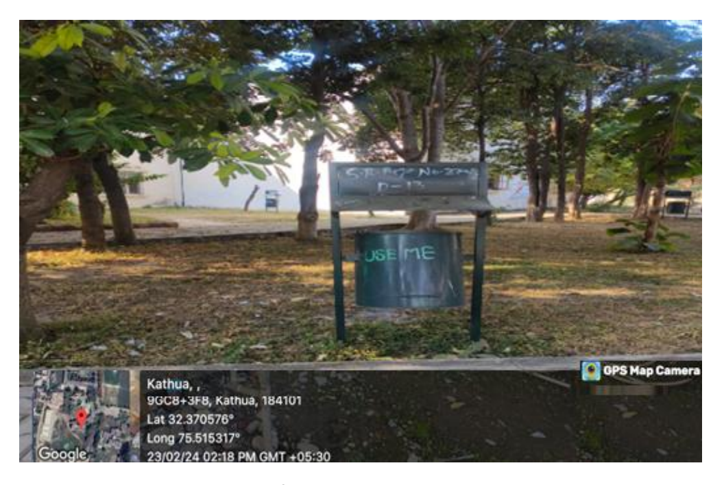
Collection of in-organic waste in Blue Bins