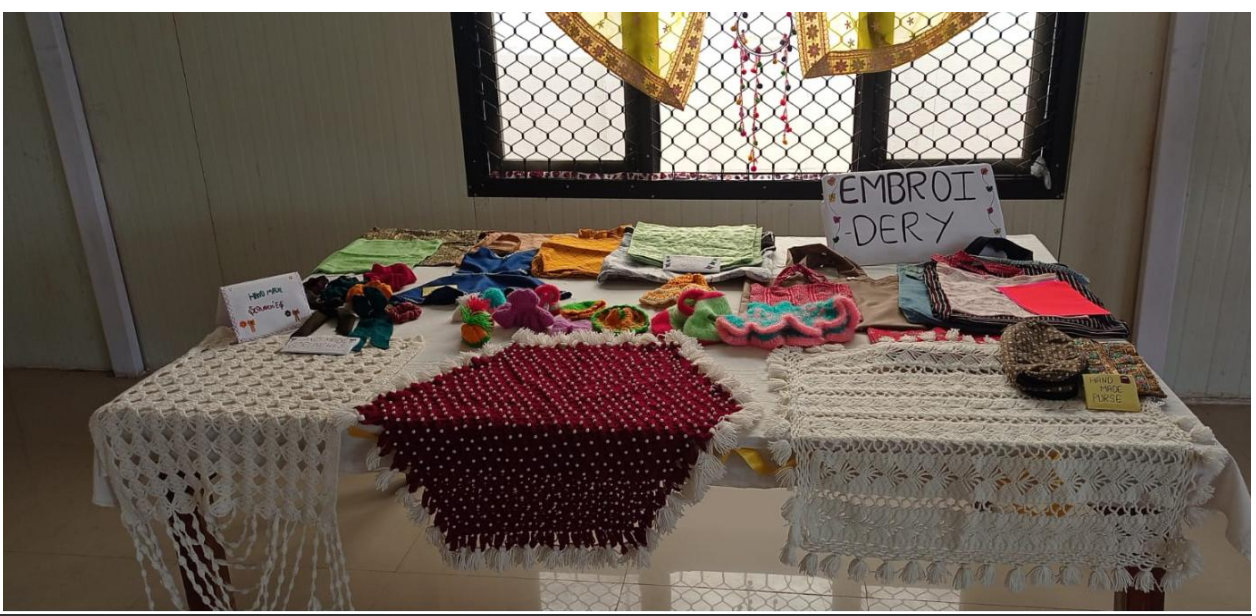
Best out of waste exhibition