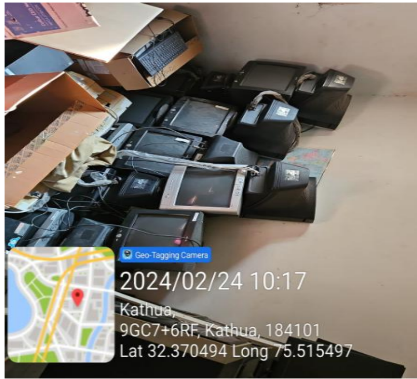
E-Waste collection for further processing